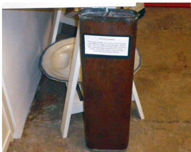
Used on early Island Railway carriages in the winter - the cylinder was filled with boiling water and covered with a rug for passengers to warm their feet.