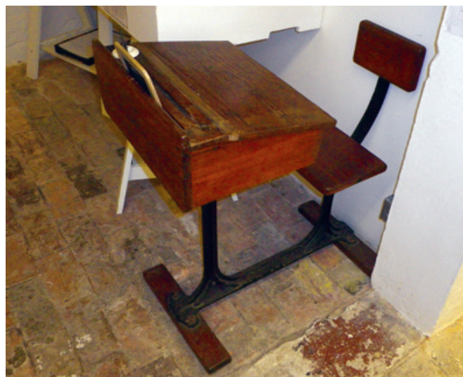
School desk from the 1940s, possibly earlier, on loan from IOW Council.