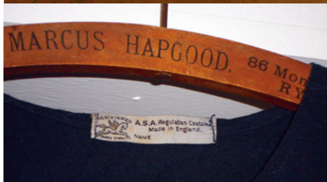
Swimming costumes c. 1920, the one on the right has "ASA Regulation Costume" on its label.