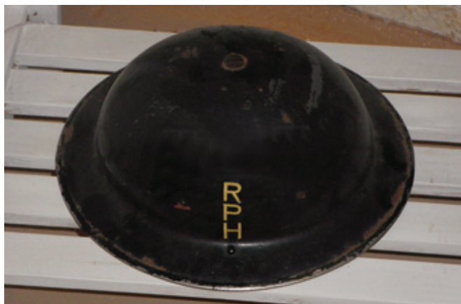
Second World War Fire Helmet from Ryde Pier Head.