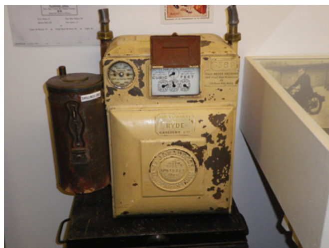
Vintage Gas Meter from the Ryde Gaslight Company.