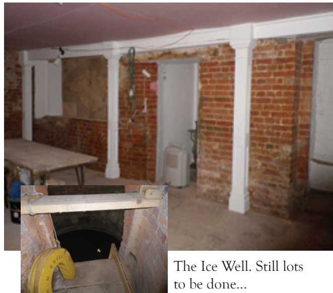
The Ice Well. Still lots to be done...