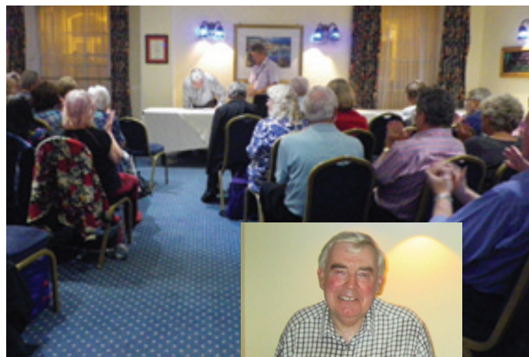
Above: Ray Allen prepares to start his talk, and in mid flow, right.

On September 21st, Ray Allen - creator of Some Mothers Do 'Ave 'Em gave a wonderful talk to a packed house at Yelfs Hotel about his life and times as he wrote the well known sit-com and struggled to get it aired on tv - very witty and hugely entertaining it was a great evening.