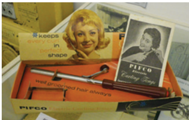
Pifco curling tongs bought at Youngs, The Radio Specialists, 16 High Street, Ryde.

A selection of new and old items you may have missed.