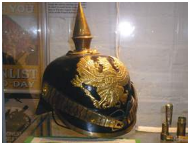
A Prussian Guard's Helmet from WW1.

A selection of new and old items you may have missed.