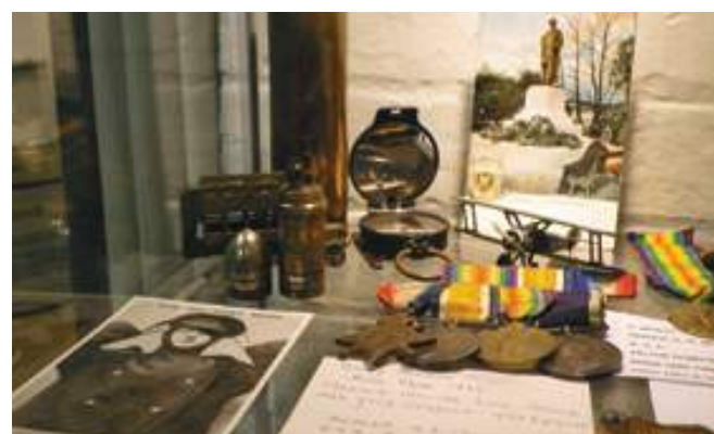
A selection of war artifacts and medals.