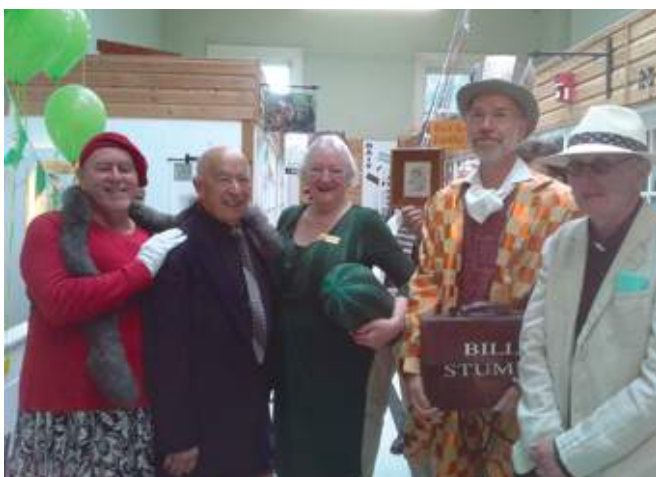
Opening of the Donald McGill Museum, August 2014

Following both the recent events within the society, and the cataclysmic changes within the country and abroad, I'm not going to be brave enough to try to predict what the society and centre will look like in the next five years. However, knowing HRS and its members and volunteers, things will be carrying on cheerfully in one form or another, with the big red button proclaiming "That was easy!"