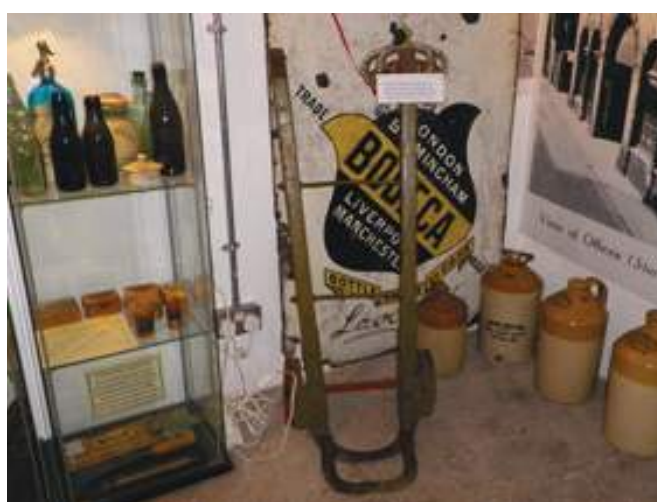
Trolley from Ryde Pier c.1910 used to transport barrels to First and Last pub.

We have many more interesting items, each with a story to tell, waiting for you to come and take a further look.