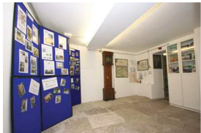
Ready for the Duke of Gloucester to open, July 2012

A year later, our first Royal visitor, the Duke of Gloucester, opened the extension into the commercial room and the flight path. Soon afterwards, our intriguing ice well was discovered behind a brick wall. Subsequent years have seen the four rotunda rooms refurbished to become a home for Royal British Legion and Isle of Wight Rifles memorabilia. Then, a couple of years ago, we took on the Donald McGill postcard collection, following the closure of The Orrery.