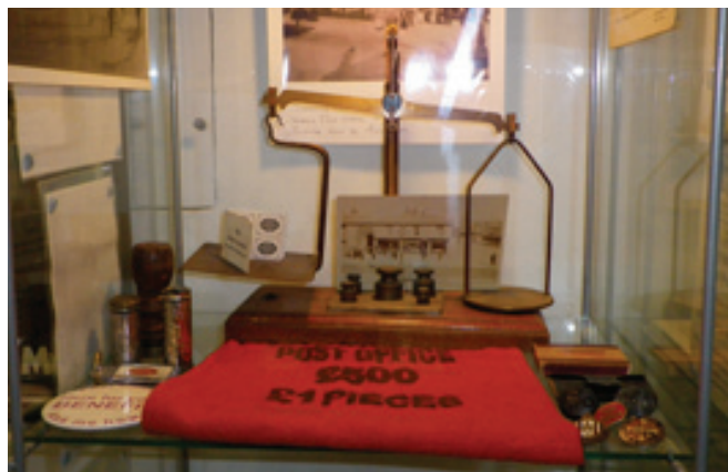
Set of Scales from the old Swanmore Post Office.