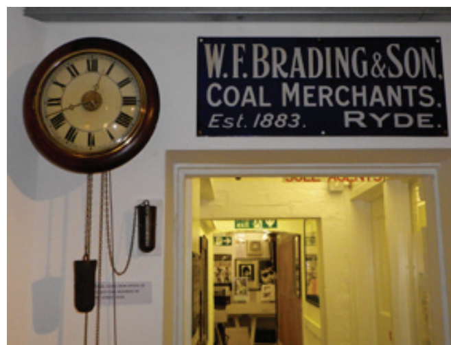
The office clock from W.F. Brading & Son Coal Merchants in Ryde.

We have many more interesting items, each with a story to tell, waiting for you to come and take a further look.