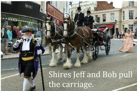
Shires Jeff and Bob pull the carriage.