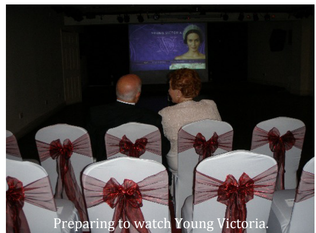
Preparing to watch Young Victoria.