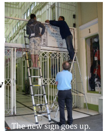
The new sign goes up.